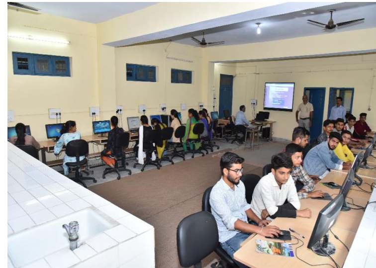
Physics Computer Laboratory